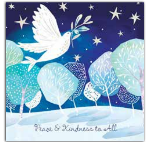
6. Flying Dove with Olive Branch Greeting C - £3.75