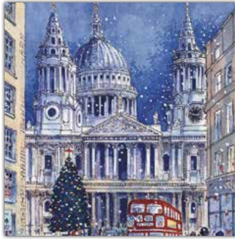
2. St Paul's Greeting D - £3.75