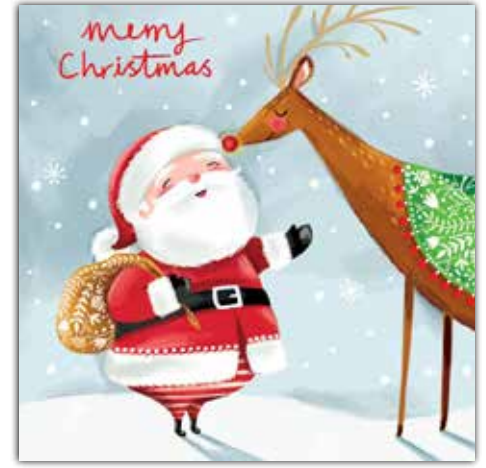
3. Santa's Friend Greeting A - £3.75