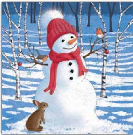
4. Snowman and Friends Greeting B - £3.75