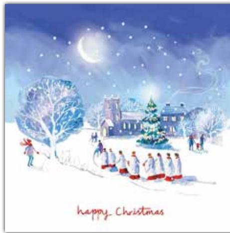
5. Christmas Choir Greeting B - £3.75