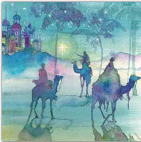
7. The Magi - Greeting D - £3.75