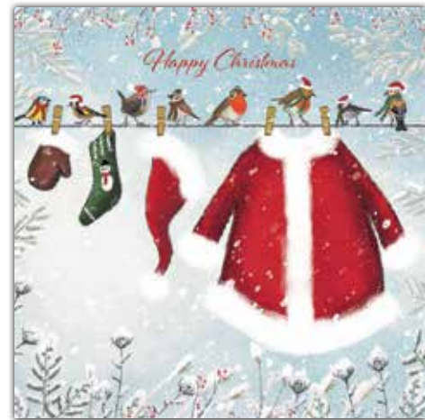
8. Santa's Friends - Greeting A - £3.75